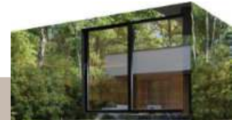
MIRROR / MIRROR +