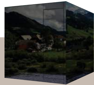
PARSOL DARK GREY