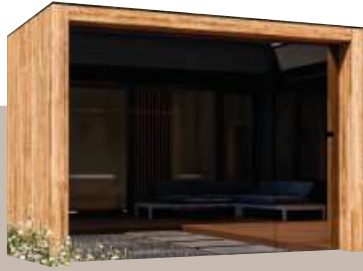
PARSOL DARK GREY

DELIVERY & ASSEMBLY: The sauna is prefabricated in the factory and is delivered directly to the construction site by prior arrangement. Generally, the customer is responsible for organizing all installation measures unless otherwise agreed. Final assembly, including electrical connection for testing, commissioning, functional testing, training, and handover will be carried out by the seller's or manufacturer's assembly team.