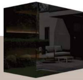
PARSOL DARK GREY